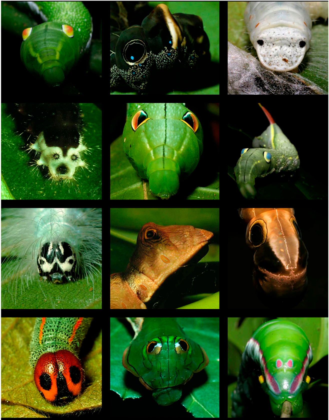
Fig. 3. Representative ACG caterpillar false eyes and faces (see SI Appendix, Table S1 for names and voucher codes and SI Appendix, Figs. S3–S8 and ref. 24 for lateral and dorsal views of the same species of caterpillars).