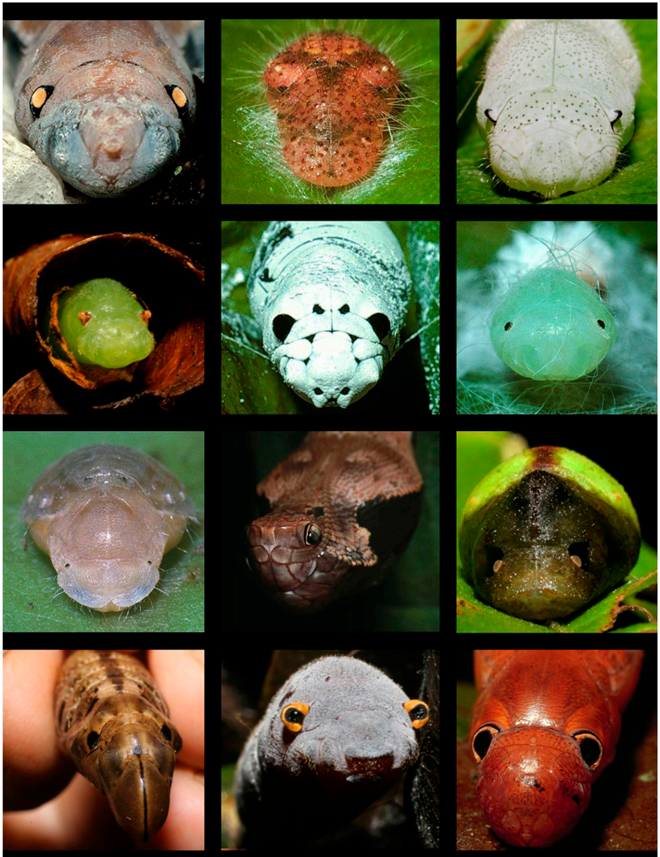
Fig. 4. Representative ACG pupa false eyes and faces (see SI Appendix, Table S1 for names and voucher codes and SI Appendix, Figs. S9–S14 and ref. 24 for lateral and dorsal views of the same species of pupae).