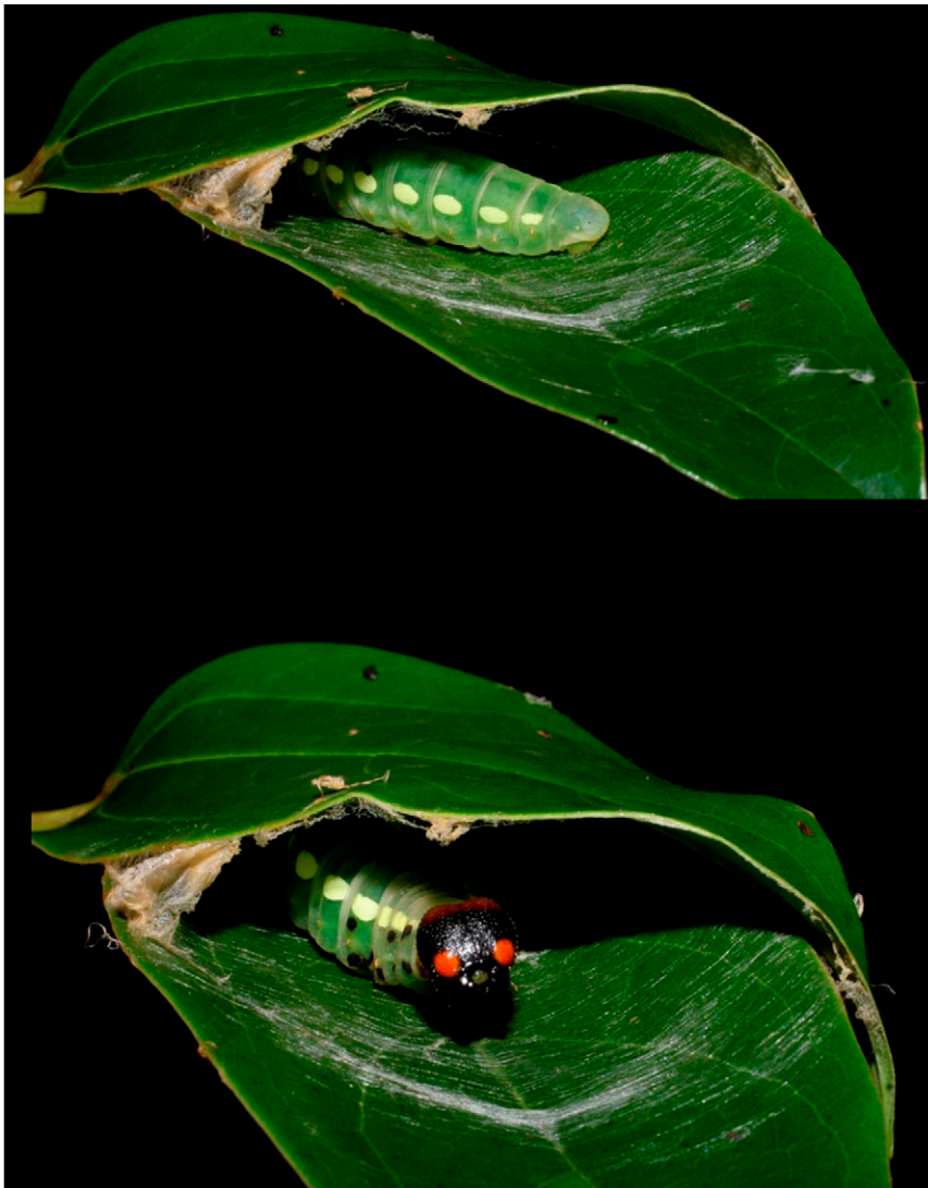
Fig. 2. The 50-mm-long last instar caterpillar of Costa Rican Ridens panche (Hesperiidae) at the moment when its leaf shelter is forced open ( Upper ) and a few seconds later ( Lower ), when it presents glowing red false eye spots directed at the invader and glowing lemon-yellow eye spots in the dark of the cavern behind. Both kinds of false eyes are thrust at the leaf roll entrance until the invader leaves.

Each of these species of immature moths or butterflies has its own evolutionary pedigree. Each has its own degree of retention of traits that have been intensively favored by natural selection in the past and that may not be maintained today by anything more complex than phylogenetic inertia, the absence of an opposing selective force (11), and the multispecific array of insect-eating birds scouring tropical vegetation every day, year in and year out. Once a species has evolved false eyes (or any facial pattern that elicits a fear/flee reaction), those false eyes may barely diminish crypticity